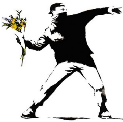
Society as change (above: Banksy)...

Department of Sociology and Social Work University of Wisconsin-Stevens Point